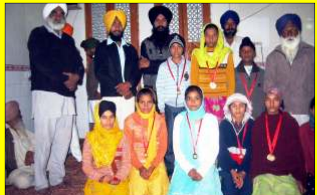
ਪੰਜਾਬ ਕ੍ਰਿਕਟ ਗੇਮਜ਼ ਵਿੱਚ ਖੇਡਣ ਵਾਲੀਆਂ ਟੀਮਾਂ ਦੀ ਸ਼ੁਰੂਆਤੀ ਸਮਾਗਮ ਦੌਰਾਨ ਸਟੇਜ 'ਤੇ ਪ੍ਰਦਰਸ਼ਨ ਕਰ ਰਹੀਆਂ ਟੀਮਾਂ ਦੀ ਫੋਟੋ।