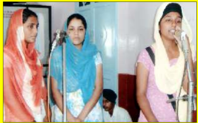
ਪੰਜਾਬ ਕ੍ਰਿਕਟ ਗੇਮਜ਼ ਵਿੱਚ ਖੇਡਣ ਵਾਲੀਆਂ ਟੀਮਾਂ ਦੀ ਸ਼ੁਰੂਆਤੀ ਸਮਾਗਮ ਦੌਰਾਨ ਸਟੇਜ 'ਤੇ ਪ੍ਰਦਰਸ਼ਨ ਕਰ ਰਹੀਆਂ ਟੀਮਾਂ ਦੀ ਫੋਟੋ।