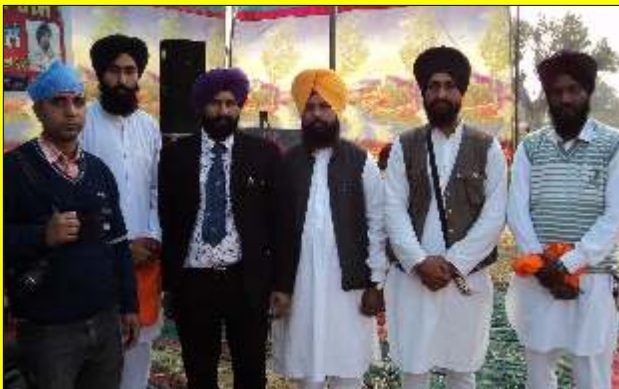
ਪੰਜਾਬ ਕ੍ਰਿਕਟ ਗੇਮਜ਼ ਵਿੱਚ ਖੇਡਣ ਵਾਲੀਆਂ ਟੀਮਾਂ ਦੀ ਸ਼ੁਰੂਆਤੀ ਸਮਾਗਮ ਦੌਰਾਨ ਸਟੇਜ 'ਤੇ ਪ੍ਰਦਰਸ਼ਨ ਕਰ ਰਹੀਆਂ ਟੀਮਾਂ ਦੀ ਫੋਟੋ।