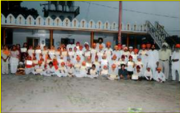
ਪੰਜਾਬ ਕ੍ਰਿਕਟ ਗੇਮਜ਼ ਵਿੱਚ ਖੇਡਣ ਵਾਲੀਆਂ ਟੀਮਾਂ ਦੀ ਸ਼ੁਰੂਆਤੀ ਸਮਾਗਮ ਦੌਰਾਨ ਸਟੇਜ 'ਤੇ ਪ੍ਰਦਰਸ਼ਨ ਕਰ ਰਹੀਆਂ ਟੀਮਾਂ ਦੀ ਫੋਟੋ।